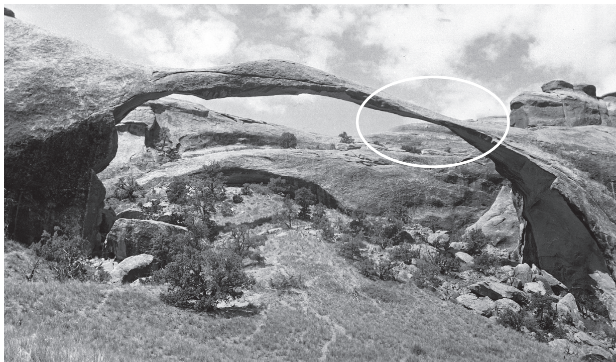
Landscape Arch in the 1950s. Oval indicates area from which rock fell in 1991. Compare this photograph with the slope under the arch today. Notice the numerous foot paths under the arch in the photo, caused by people walking off the trail. These "social trails" kill vegetation and invite erosion of the desert landscape. Since the trail under the arch has been closed, the vegetation is slowly recovering.

Landscape Arch, one of the world's longest stone spans, stretches 306 feet (93 m), yet is