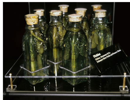
Figure 3. Square bottles in a customized acrylic restraining shelving shelf.

Line the cut-outs with moleskin to prevent abrasion to the object. Shelves can be fabricated by specialized mount-making firms that handle acrylic sheeting, or by museum staff proficient in cutting acrylic sheeting.