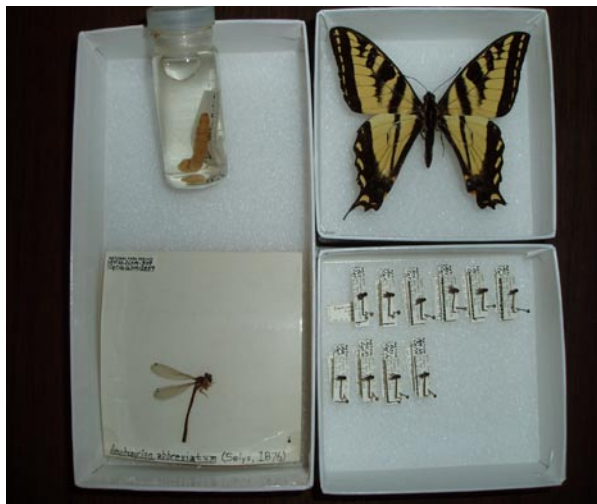
Figure 1: Various curation methods for insects.

Insects may be preserved either as dried or wet specimens. Dried specimens may be preserved on pins, mounted on points, or in envelopes. For pinned specimens, larger insects are pinned through their bodies and smaller insects are mounted on points. In larger collections not all specimens of butterflies and moths may be pinned. Some may be stored in glassine envelopes. The current standard for curating large collections of dragonflies and damselflies is placing specimens and supporting cards in clear envelopes.