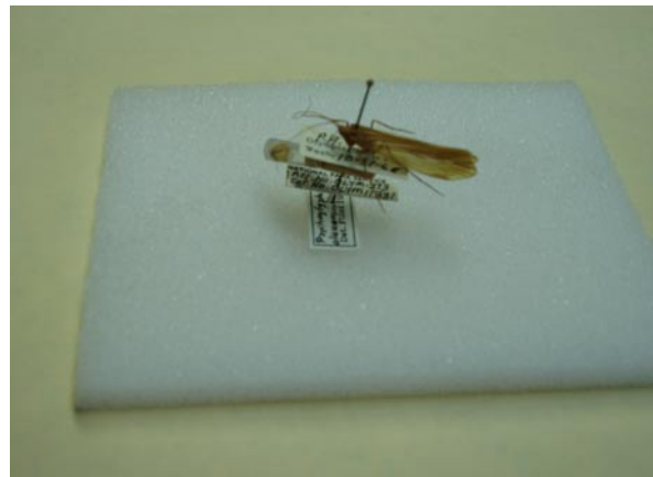
Specimen with various labels as well as genetical vial (containing dissected genitalia).

Insect labels for most pinned specimens may vary somewhat in size but ideally should not be larger than 2 x 1 cm. Labels are placed on the pin below the insect with the top of the labels facing right. Ideally, multiple labels are placed at intervals so they can all be read without moving them. However, if there are too many labels they will have to be compressed. This could happen if a specimen was identified a number of times by different researchers who should each add their own label. No labels should ever be removed (except field collection labels).