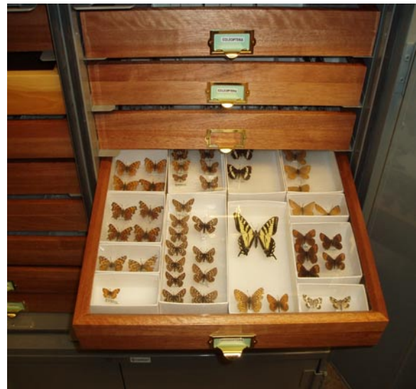
Figure 2: Insect specimen curation in unit trays placed in drawer within entomology cabinet.

Dried, pinned insects are generally stored in unit trays that are placed in insect drawers which are housed in entomology cabinets. However, a small collection may be housed in