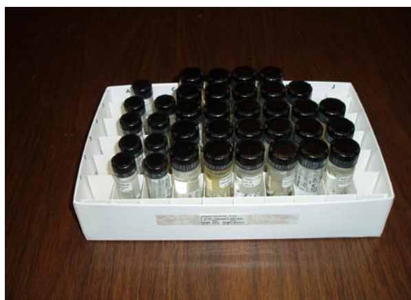
Figure 3: Storage of wet specimens, one option.

Insects collected in fluids may remain in fluid, be transferred to another fluid, or pinned, if appropriate. Collection fluids other than 70% alcohol are usually used for initial preservation purposes and not for long term storage. In general, all soft bodied insects should remain in 70% alcohol, whereas hard bodied specimens can be removed from alcohol, rinsed, relaxed if necessary (see relaxing specimens below), and pinned. There may be reasons to keep whole samples in alcohol. For example, it may be more efficient to keep fish stomach samples complete in individual vials rather than separate and pin some specimens.