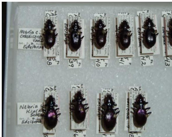
Figure 9: Specimens lined up by species in unit tray.

Due to the diversity of insect species and sheer numbers of representatives, space is of utmost importance in the storage options of insects. Pinned specimens should be labeled with appropriately sized labels and pinned in rows in unit trays as closely together as possible while maintaining enough space to remove individual specimens from the tray. The first specimen of a species should have the identification label turned 90 degrees to the left so it can be read without turning the unit tray.