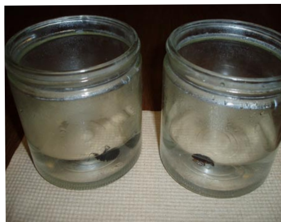
Relaxing beetles in hot water.

Dried unprocessed specimens will need to be “relaxed” before pinning. There are a number of ways to relax specimens. A relaxing chamber can be created by placing damp paper towels in the bottom of a sealed container.