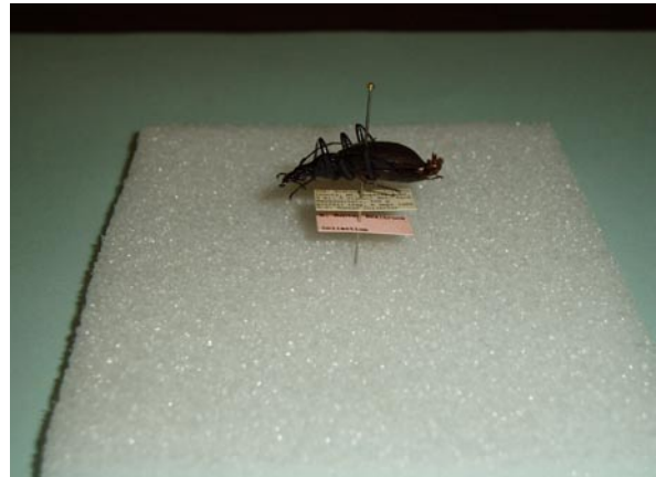
Figure 8: Position of labels underneath specimens.

Small insects of any group should be mounted on points. Points are made with a point punch which creates triangular shaped pieces of card-stock. The insect pin goes through the wide end of the point and the small insect is glued to the narrow point. The point can be curved with forceps to provide additional support for the specimen. Use as little glue as possible and be careful not to obscure any identifying characteristics. The point is glued to the right side of the insect so heads all face right. Very tiny and/or fragile specimens are sometimes double mounted (see references and web pages for details).