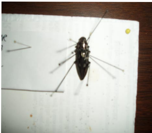
Figure 5: Specimens on pinning blocks.

Insects are placed in the chamber on platform above the damp substrate. Specimens will take from a couple hours to two days to relax. Adding a couple crushed cloves will prevent mold when relaxing larger, hard bodied insects that may take longer to soften. Most beetles, which are hard bodied, can be quickly relaxed by placing them in a hot water bath (almost, but not boiling) with a drop of detergent for 5-10 minutes. When softened they should be rinsed with another hot water bath and set out to dry for a minute before pinning.