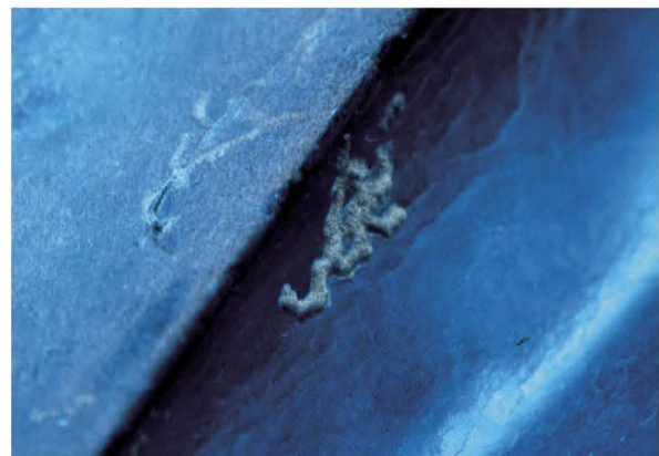
Figure 4. Leather cartridge box with tunneling by hide beetle.

The three hide beetles that cause the most damage are the larder beetle, hide or leather beetle, and black larder beetle. They feed on skins and feathers such as dead bird or mouse carcasses in attics, stuffed animals in museum collections and in birds' nests. Both the adult and larval stage damages materials. Look for feeding damage and frass created (Fig. 4) as they often burrow into or graze the surface of their food source.