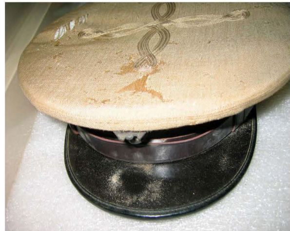
Figure 3. Grazing damage and frass from varied carpet beetle larvae.

The four most commonly encountered species of carpet beetles are the black carpet beetle, varied carpet beetle, furniture carpet beetle, and common carpet beetle. The larval stage of all carpet beetles is responsible for the damage. A carpet beetle infestation results in feeding damage (Fig. 3) and cast larval skins.