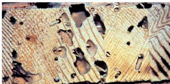
Figure 8. Drywood termite damage to a wooden door.

Unlike their cousins the subterranean termites that require a constant moisture source, drywood termites establish colonies in dry, sound wood with low levels of moisture and do not require contact with the soil. Drywood termites attack wooden items of all kinds. Most infestations are in building structures but furniture and wooden objects in museum collections may also be attacked. The excavated galleries or tunnels feel sandpaper-smooth. Dry and loose, their distinct six-sided fecal pellets are found in piles where they have been kicked out of the chambers. Other than the pellets, there is very little external evidence of drywood termite attack in wood as they tend to work just under the surface of the wood (Fig. 8). Swarming adults may also be a sign of an infestation. Winged termites have four wings of equal length whereas carpenter ants have four wings of two different lengths.