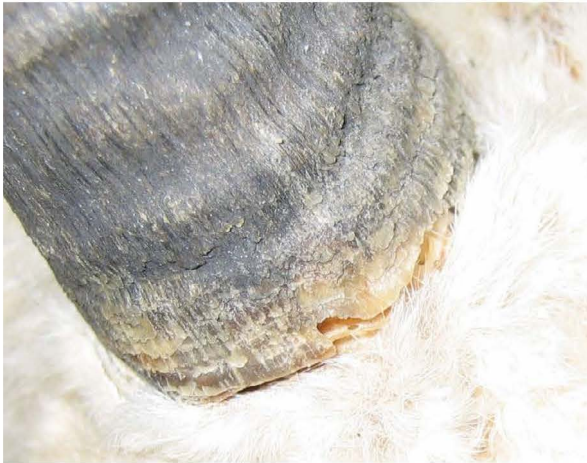
Figure 1. Dermestid larvae damage to horn.