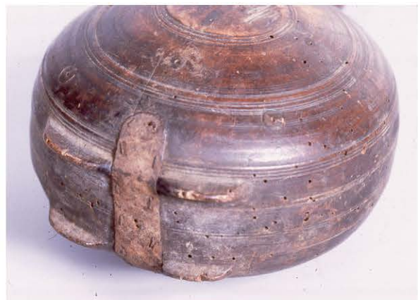
Figure 7. Canteen damaged by powderpost beetles.

Museum objects made of wood are susceptible to attack by a number of wood-infesting pests. In museums, the culprits are usually wood-boring/powderpost beetles and drywood termites. Both can severely damage valuable artifacts while remaining invisible to the untrained eye.