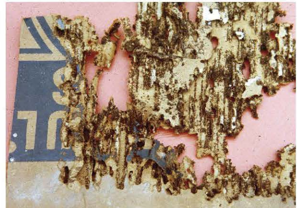
Figure 10. Silverfish damage.

Silverfish and firebrats prefer starchy foods and will eat fabrics, paper and sizing, and the glue and paste in older book bindings. They are omnivorous and will eat protein materials as well as cellulose (Fig. 10). Silverfish prefer moist situations with temperatures of 70° to 80°F and can be an indicator of moisture problems. Firebrats prefer temperatures in excess of 90°F. Signs of an infestation are seeing the insect or finding their feeding damage.