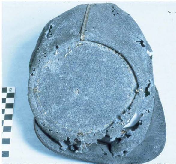
Figure 5. Civil War hat with damage from clothes moths and carpet beetles.

While many other moths are attracted to lights, these moths prefer dark closets, attics or other areas. The larvae tend to live and feed in dark corners in the folds of fabrics. Typically, the larva bites off a fiber, chews on it and moves on to the next fiber, resulting in a trail of damaged fibers. The clothes moth larvae may spin a feeding tube made of the fabric they are feeding on. Some spin small scattered silken patches and graze as they go along using the tube as protection. Look for feeding damage such as holes in woolen fabrics and hair falling from hides or pelts (Fig. 6). The color of the excreta usually takes on the color of the material on which it is feeding. Use these clues to locate infested collections.