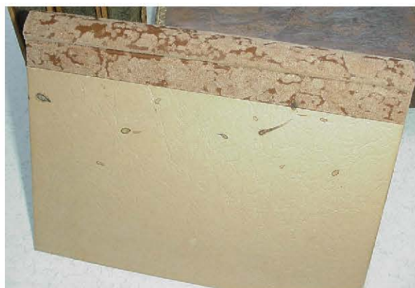
Figure 11. Cockroach damage to a book.

The oriental cockroach prefers decaying food, is cold tolerant and prefers damp areas with temperatures below 84°F. It is often found in bark mulch around the perimeter of buildings. The American cockroach requires a water source and prefers fermented foods. It can be found in sewers and basements, particularly around drains and pipes. Cockroach fecal pellets can resemble small mouse droppings without pointed ends.