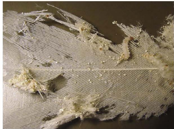
Figure 6. Webbing clothes moth damage.