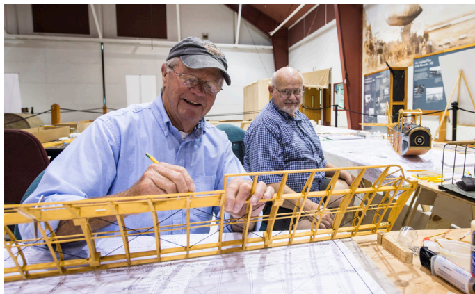
Volunteers build a model Curtiss Jenny aircraft.