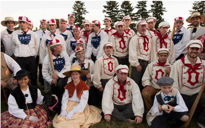
Costumed volunteers at 1860s Base Ball

“The National Park Service is keeping the memory of Dr. McLoughlin and our rich heritage alive. Working together, we reach thousands. I just gave a tour to a family from Germany who came to visit us in Oregon City just because we are part of the national park!”