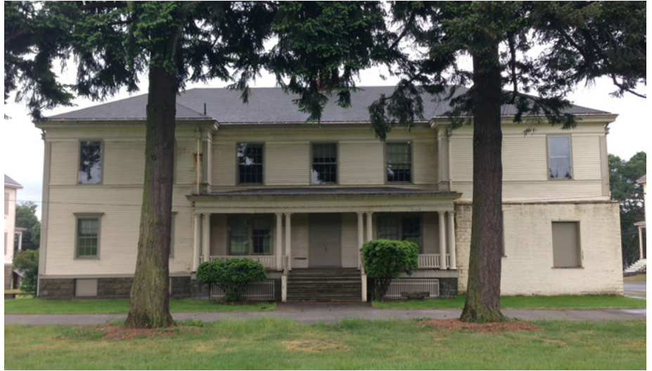
Building 991 prior to rehabilitation

Building 991, which was built in 1906, was selected as the first building for rehabilitation because, of the five large signature buildings within East Vancouver Barracks, it was in the worst condition, with a leaking roof and gutters and extensive water damage. The building is also the smallest of the five, and allowed the National Park Service to test estimating accuracy before moving on to larger projects. At its completion in November 2013, the rehabilitation of Building 991 had come in under-budget and on-schedule!