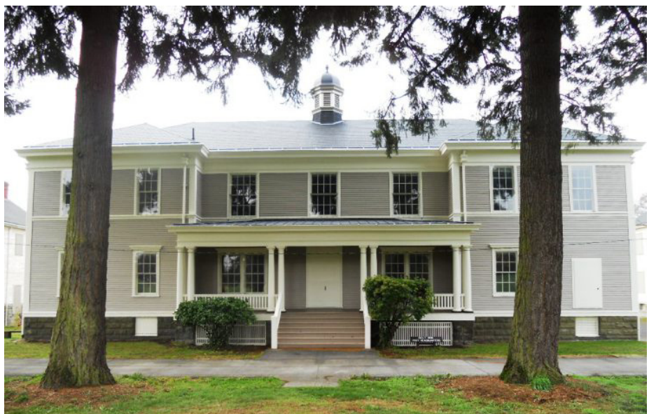
Building 991 at the completion of the project, November, 2013