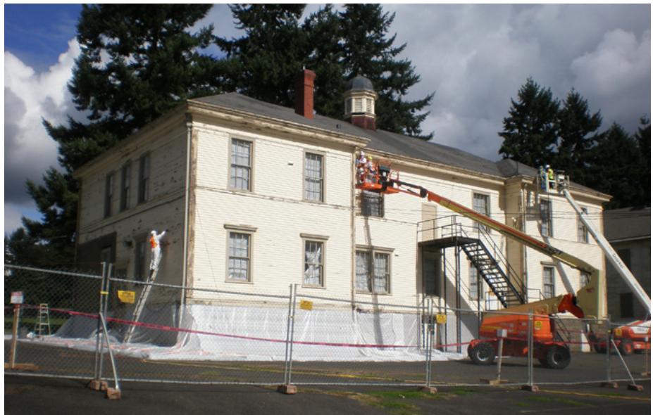
Building 991 during the project, September, 2013